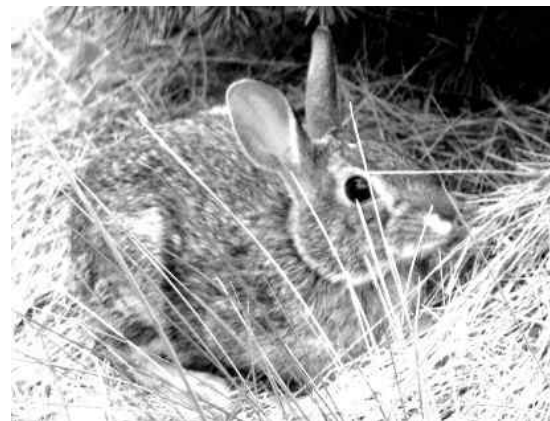
(at the OPPD Arboretum during the July 10 th AARC rabbit hunt.)

The KØUSA repeater is an open system and is available for any licensed ham radio operator to use. We welcome other clubs and organizations to use it for providing communications support for nonprofit activities. To avoid scheduling conflicts, the Club asks that you obtain permission from the AARC Repeater Committee at least 72 hours in advance. To submit your request, please click the KØUSA Use Request Form link on the AARC web site: http://tinyurl.com/msodyvh