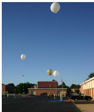
Balloons being launched at the 2009 GPSL in Topeka, KS.

The twelfth annual Great Plains Super Launch (GPSL), hosted by Nebraska Stratospheric Amateur Radio (NSTAR), will be held in Omaha, Nebraska on June 7-10, 2012. The GPSL is an annual gathering of Amateur Radio High Altitude Ballooning enthusiasts from around the country to a site in the central US where they participate in technical presentations and a group launch. This is the second time the Super Launch has been held in Omaha, the first being in July 2005. About 75 amateurs and other interested individuals are expected to attend, with 7 to 10 balloons launched on Saturday morning.