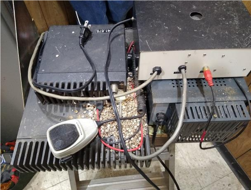
Above, Back View

The remote RX at CB got changed today so should sound better. The “cb rx.jpg” is what was installed and the other, “cb rx new.jpg” was what was taken out. Notice all the critter junk on top of it. It will eventually find its way back to my basement for a capacitor swap to fix the de-emphasis and remain as a spare or possible use later if there is a hole we want to fill. — John WBOCMC