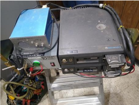
Left, Front View