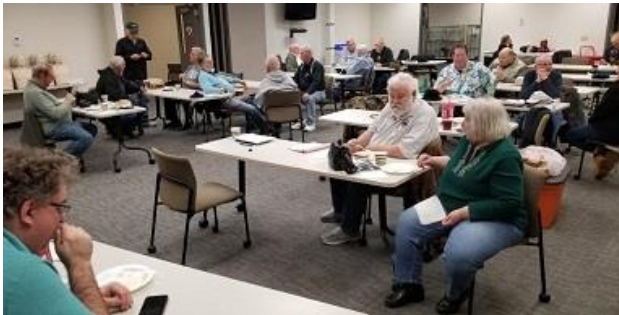
AARC Members enjoying a meal at the December 2021 Club meeting.

The Aksarben amateur radio club annual holiday party saw 27 members and guests in attendance. There was a wide variety of delicious food including: meat tray/cheeses/smoked sausage/meatballs/salads/chips and desserts. The evening began with a short business meeting to elect officers for the upcoming year followed by a raffle that had the usual great variety of prizes. It was great to see everyone enjoying themselves eating/visiting, and talking about some of our plans for the new year.