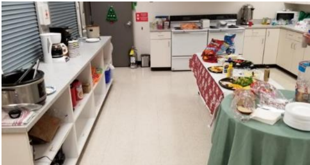
Food being prepared in the kitchen .