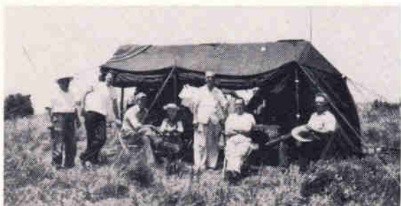
A Few Showed Up And Donated Gear