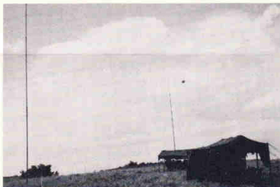
The Same For The C.W. And 10 Mtr. Tents