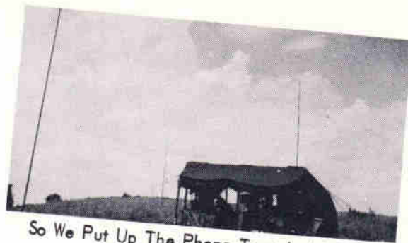
So We Put Up The Phone Tent And Masts