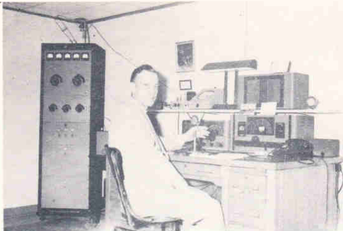
W Q Y Z K - STATION OF THE MONTH