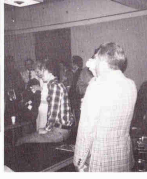
NOVEMBER MEETING PHOTOS