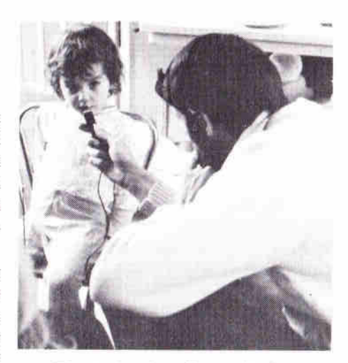
This little lady suffers no "mike fright" as she talks with Santa Claus via two-meter radio.

The writer of this article — monitoring these transmissions over the Council Bluffs repeater and February 1975 H.