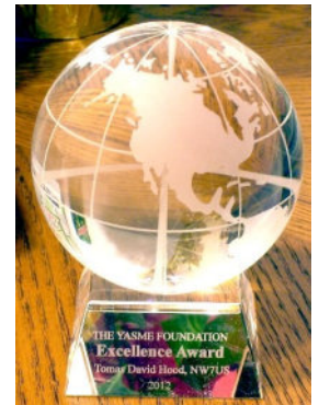
YASME Excellence Award