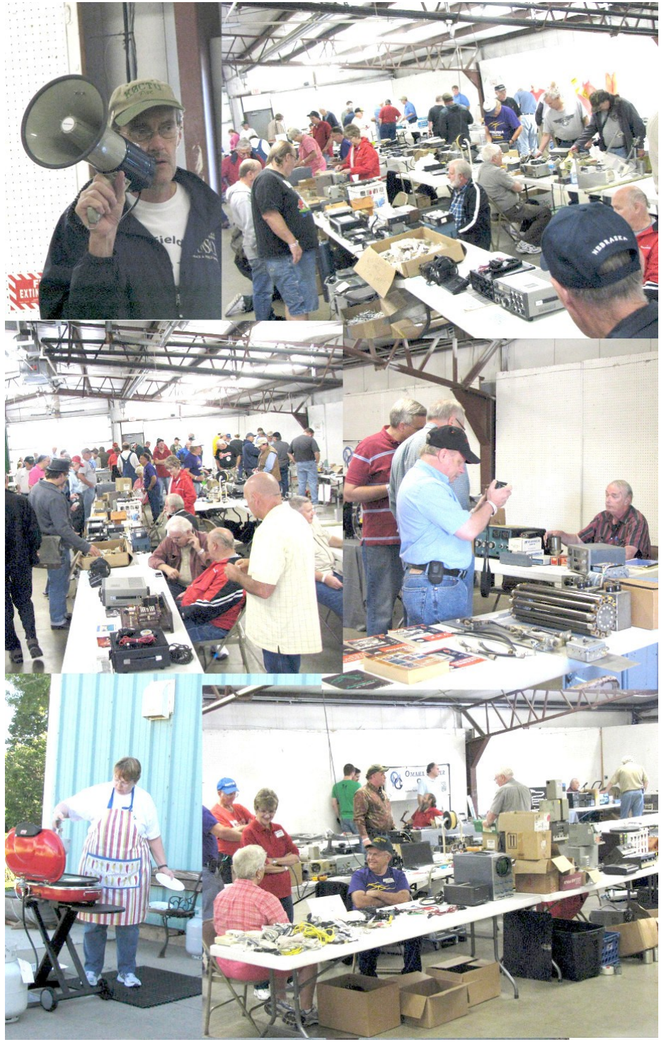
AARC Flea-esta, 2014