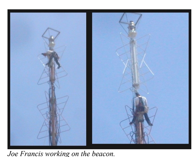
This antenna is actually two on one mast. One is an east-west array and the other a north-south, giving an omni-directional pattern; hence, the two lines. Everything got reconnected before we left that evening. We put the new transmitter back on and it ran really well the rest of the evening. There is a mini-studio on the mountain with a couple of VCRs and DVD players. The microwave link from the church still wasn't working.