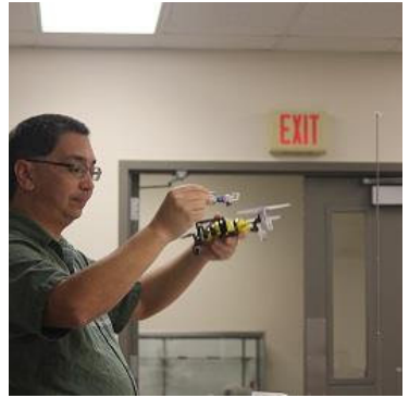
and Channels. He further explained how their radios relate to Hams and what radios require an FCC License to operate.