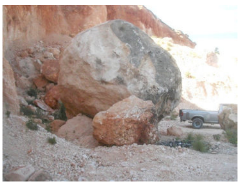
Marble boulder at the quarry. Note the truck next to it.

After I got home I got to thinking; there should be an electrical supply store in the Rivera Beach area. I googled it and there was. They also do local deliveries free. I ordered what was stolen and had it delivered to Teeters. We also have a 20 foot container with