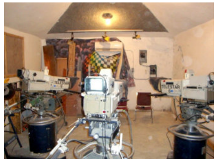
Three new cameras from KETV, Omaha and the new electrical on the far wall.

After breakfast we went to the mountain to get some of the electrical materials sent by the Canadians. Revenel had put it up there for safe keeping. When we got there it was gone along with every bit of spare copper line, five spare tubes for the old