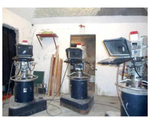
Three new cameras.

While I was setting up the cameras and pedestals, I saw that one of them still needed more weights for balance. I had given a sample to Revenel so some could be made out of iron. The originals were lead. As I was checking one of the pedestals for lubrication of the wheels, I removed the cover plate and found a lead weight