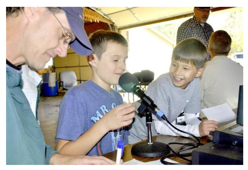
·CAMP ·CED·AR ·NEB·R·A·S·K·A