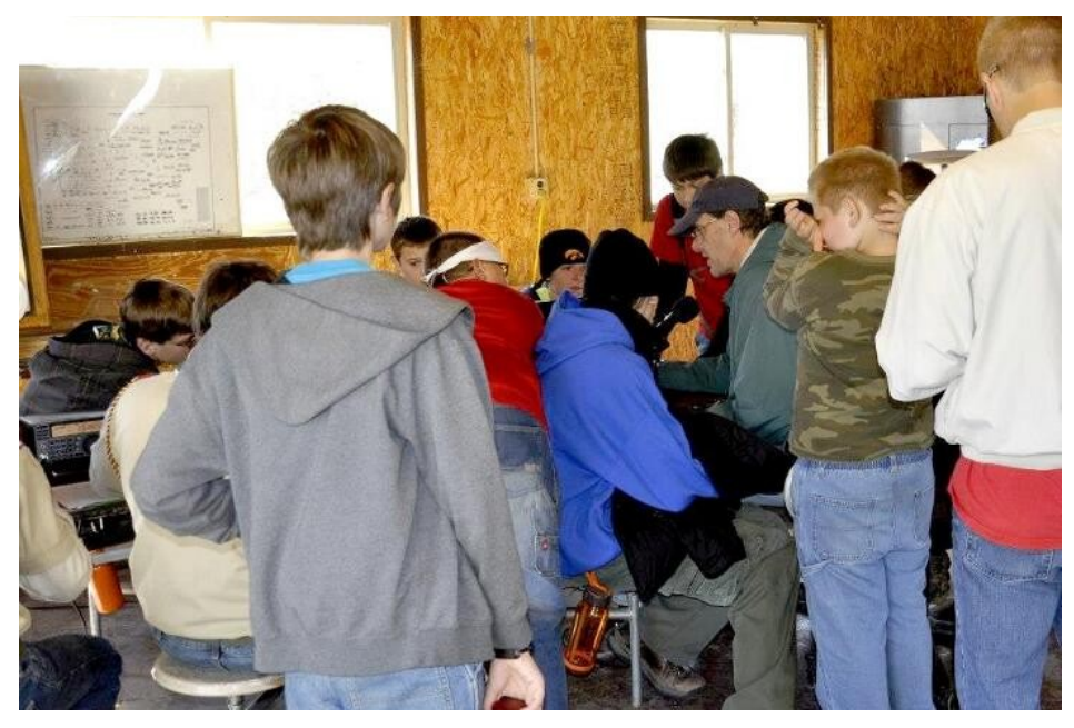
JAMBOREE ON THE AIR