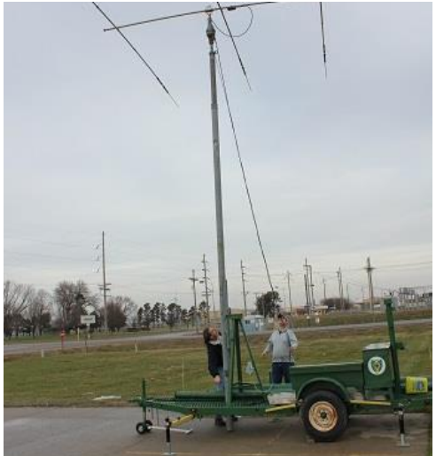
Pat—K0CTU and Russ-AD0QH set up the antenna tower at the NWS parking lot.