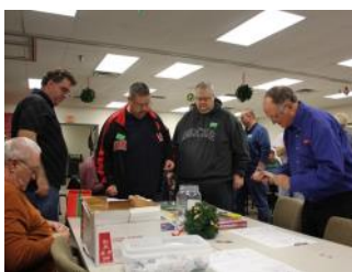
The Line is backed up as members Purchase last minute tickets