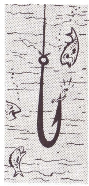
"Hey, fellas, that Texan's back again!"

Sgt. Scot Thompson (WBØWOT) C Troop 1-17th Air Cavalry Box 14 Ft. Bragg, NC 28307