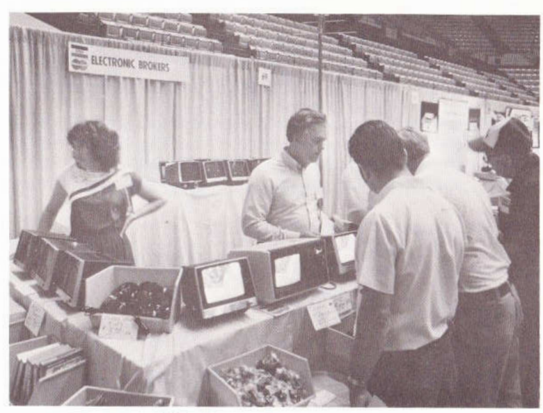
"Won't somebody buy a tv?"