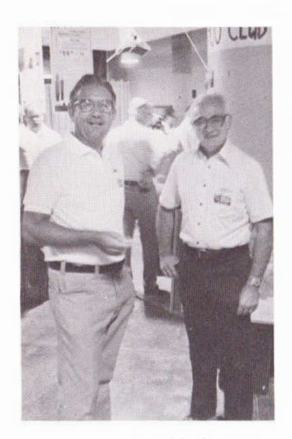
Two of a kind