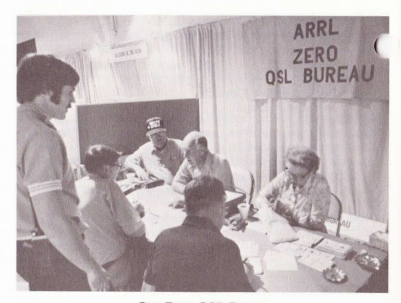
Our Zero QSL Bureau