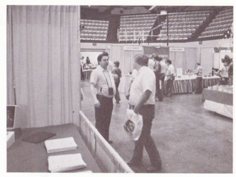
"I know Sandy is looking for me, I'm going back to the flea market anyway!"