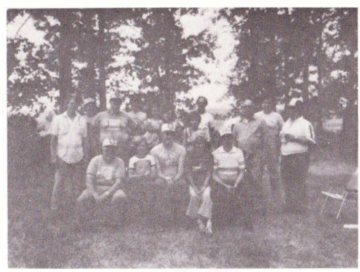
Field Day 1982