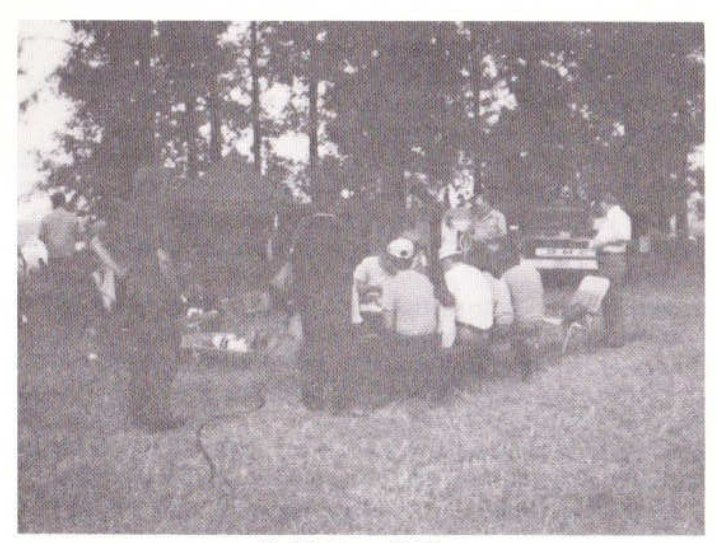
Field Day 1982 Chow time