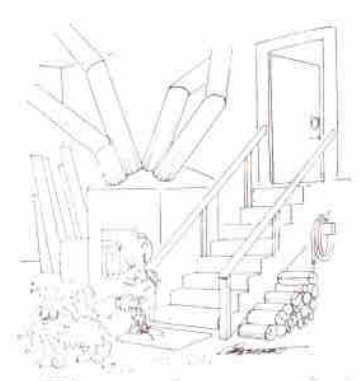
"Who put the spray starch where Rover's flea repellent used to be?"