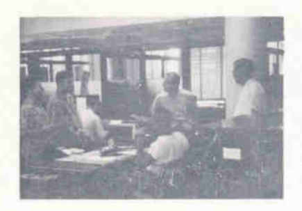
"Ham Hum Workers in Session"