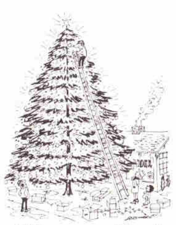
"Fifteen years ago I thought a live Christmas tree was a dandy idea!"