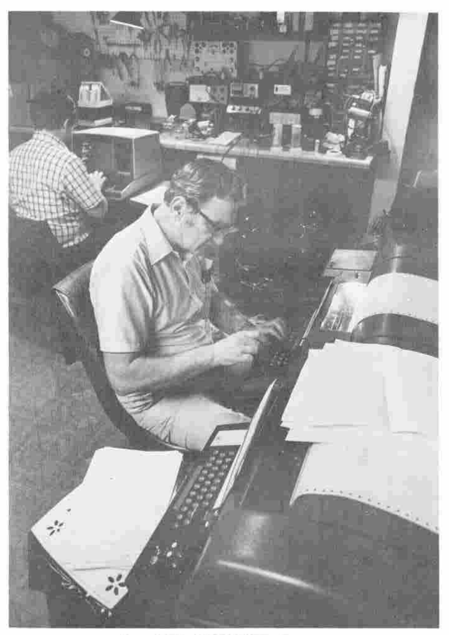
From QTH of WDØDLN in Omaha