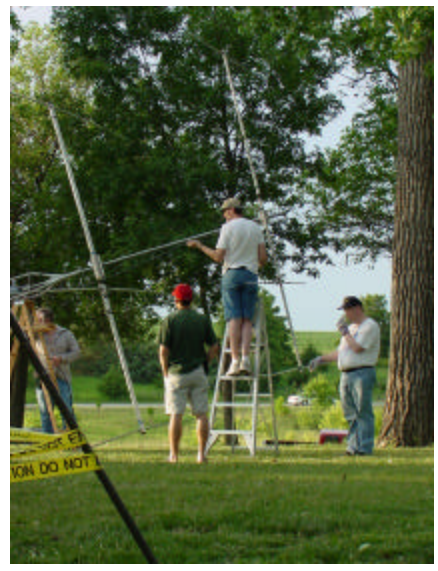
\label{thm:continuous} \begin{tabular}{ll} Tower assembly was taking place Friday night out at Standing Bear Lake. \end{tabular}