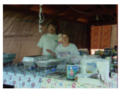
NØPOT and NØWAV "man" the cook shack.