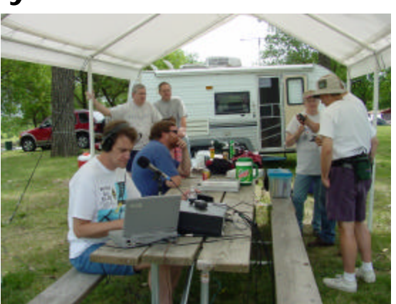
Contacts continued to pile up on Sunday morning, right up to teardown.