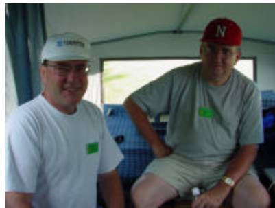
K9RZ and ABØFX take a break from 20 CW.