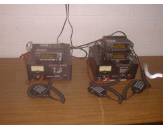
A view of the OMMRS Radios that were installed at Immanuel Hospital.

Thanks for your support of emergency preparedness and your local ARES organization!