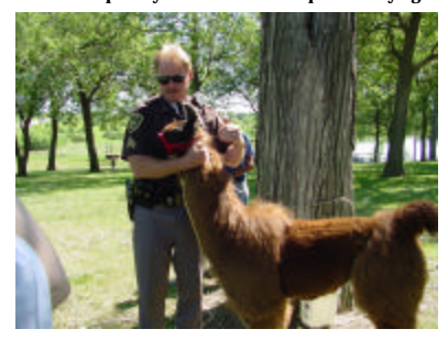
A Douglas County deputy visits the llama.

biting fly, the dits from 20CW, the QSL? from 40 and 15, the patrols by the local constabulary, the proclamation visit by a local government official, the TV crews, the llama.... The llama?!...right, we even had a visitor that I'll bet no other Field Day crew can say they had... We had a llama! Once