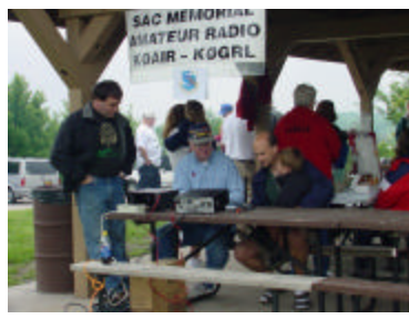
The KØAIR callsign was used to make a few HF contacts, including the Battleship New Jersey!